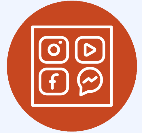
Social Media Managment