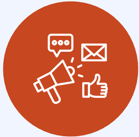
Email and SMS Marketing