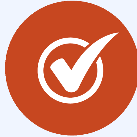
WhatsApp Green Tick