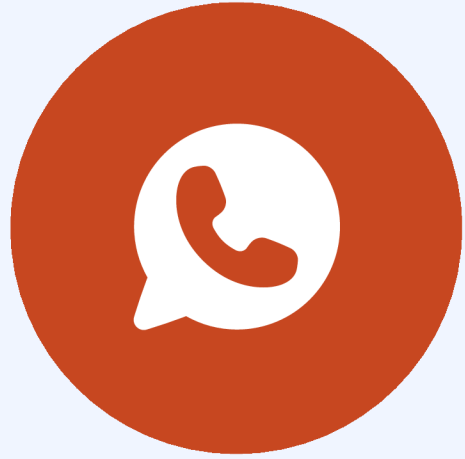
WhstsApp Business Setup