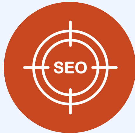
SEO & Ranking